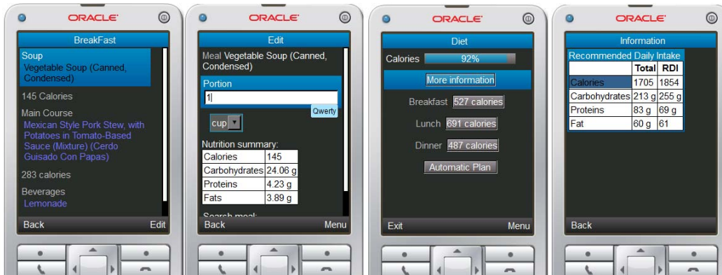
Figure 4a) Interface to modify diet

This plan is most adequate to ideal values proposed (as you can see in Figure 4b). The command-line option -N=1000 tell dlv to compute operations until number 1000 as maximum value. Option -FP is used to invoke the planning front-end in dlv . Alternatively, one can use the options -FPopt and FPsec , which explicitly enforce optimistic and secure planning, respectively. For planning problems with a unique initial state a deterministic domain, these two options do not make a difference, as optimistic and secure plans coincide in this case. This solution is clear, simple and all rules in IR and CR have to satisfy the safety requirement for default negated type literals, i.e., each variable occurring in a default negated type literal has to occur in at least one non negated type literal or dynamic literal.