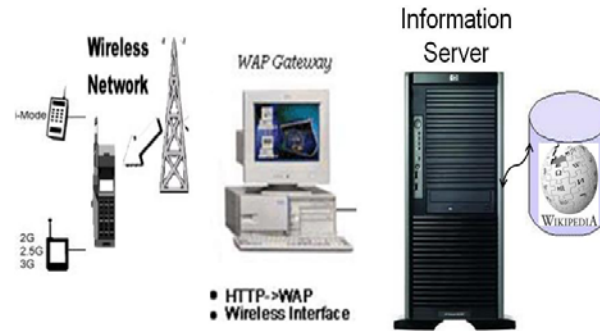
Figure 5 Architecture for our application

standard for application layer network communications in a wireless communication environment. Its main use is to enable access to the Mobile Web from a mobile phone or PDA.