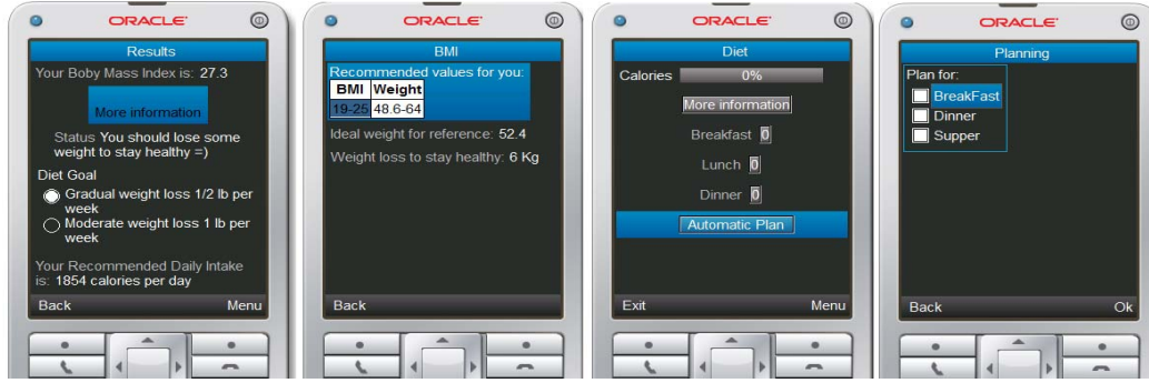
Figure 3a) BMI