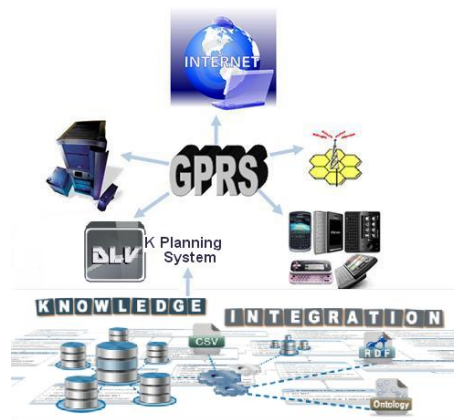
Figure 6 General architecture

The best known markup language is Hypertext Markup Language (HTML). Unlike HTML, WML is considered a Meta language. WAP also allows the use of standard Internet protocols such as UDP, IP and XML. Although WAP supports HTML and XML, the WML language (an XML application) is specifically devised for small screens and one-hand navigation without a keyboard. WAP also supports WML Script. It is similar to JavaScript, but makes minimal demands on memory and CPU power because it does not contain many of the unnecessary functions found in other scripting languages. The WAP programming model is similar to the Web programming model with matching extensions, but it accommodates the characteristics of the wireless environment. In figure 6, shows the proposed architecture for nourishing system. The module for obtain a custom and automatic plan to support people improve their general health was implemented as Web services using standard languages [15]. It takes data from a mobile device; these data are sent to the web service which returns a specific plan obtained from DLV K system, similar to [10].