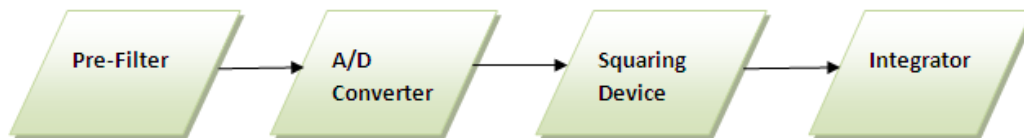
Figure 1: Block diagram of Energy Detector

Figure 1, shows the block diagram of energy detector.