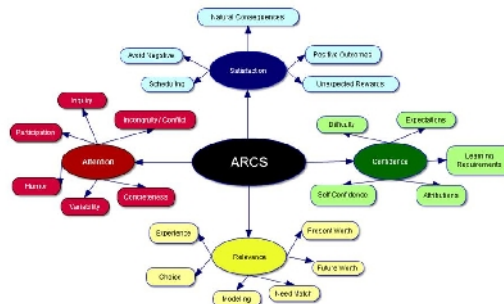
Figure2: Kellers' motivator didactic model (ARCS)

Various models have presented, including Keller learning model (ARCS). Keller believes that, motivation is under effect of individual, environmental, specialties and learning materials. Keller, in his motivational, educational designing, composing theories and motivational procedures with educational designing, and forms an application result that causes learners to do more struggle to achieve educational goals EQ emotional model. This model emotion or feeling has much effect on learning Sam 2009. After making emotional remembrance as compare with text reports, that essential motive comes manifest the emotional model of human is, as a positive spectrum of emotions like joy, pleasure, hope and sympathy and negative spectrum consist of sadness, anger, fear disappointment and aggressiveness, emotion in the procedure of education must be in positive spectrum and preferably must be in the form of active and several of learning model which must take care to archive goals.